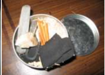
Left:Firestrikers. Right:our tinderbox.

We also used a piece of the mystery calico to make a waxed drawstring bag to hold our tinder box and keep it dry. It was treated with a mix of beeswax and linseed oil, and hand sewn using double running stitch for extra strength. Beeswax has been used as waterproofing agent since pre history and linseed oil is hydrophobic; it repels water. Linseed oil is made from flax seeds, from the same plant used to make linen.