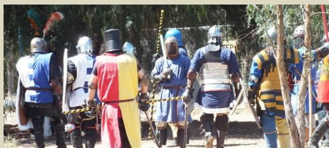
Preparing for Battle BWXIV

War Points apply to the Arts & Sciences and Bardic Competitions and will add to your War Band's overall score