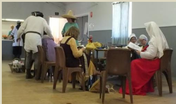
A & S at Border War XIV

This is the Grapevine ; a publication of the Shire of Bordescros of the Society for Creative Anachronism Ltd. Grapevine is not a corporate publication of either the Society for Creative Anachronism, Inc, or the Society for Creative Anachronism Ltd and does not delineate SCA policies.