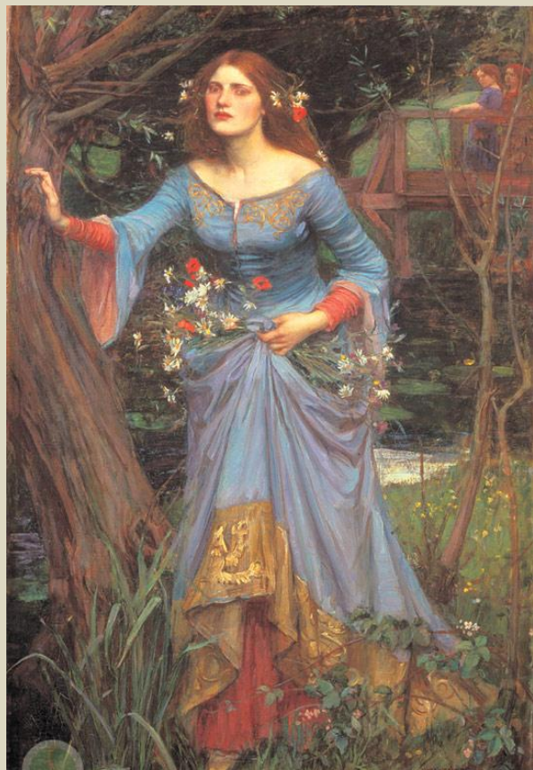
Ophelia, JWW Waterhouse, 1905 http://www.jwwaterhouse.com/paintings/