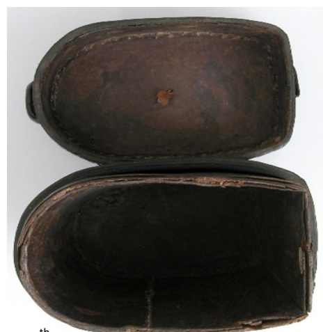
15 th century French case displaying internal stitching and layers. The Metropolitan Arts Museum .