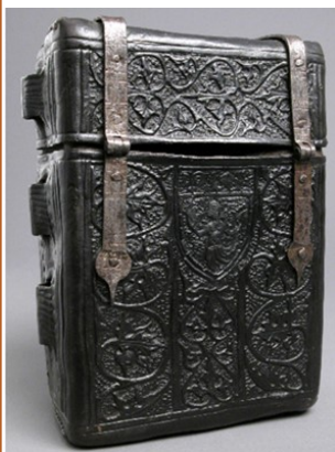
15 th century French case for a book. The Metropolitan Arts Museum

The term 'Cuir Bouilli' can be roughly translated as 'boiled leather', although the exact techniques or methodologies the term refers to appear to be the subject of some confusion and speculation. This could be the result of information lost over time, the changing definition of the words, or that the phrase cuir bouilli could be applied to many differing techniques. What seems to be agreed upon is that the result is a leather object that is shaped and hardened through the application of heat.