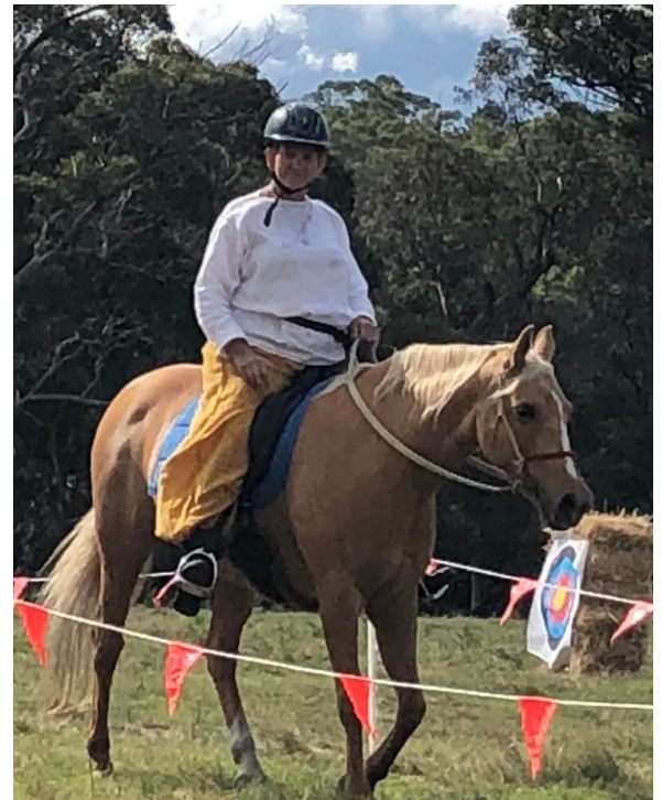
KEqM, Teneg Yagaan, checking the safety of the Horse Archery lane.

Training in Progress, looking back toward the horse camp on the right