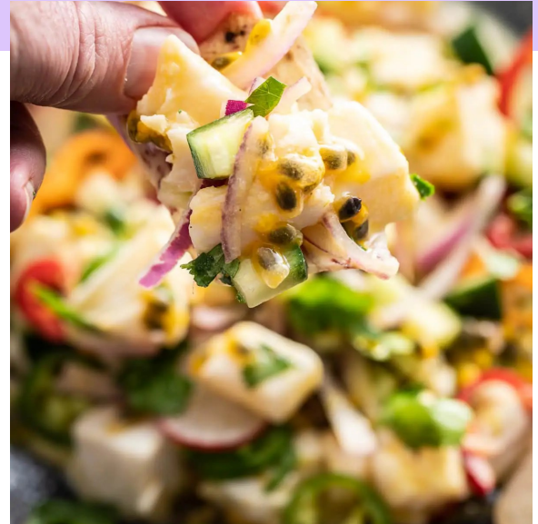
Ceviche with Passionfruit, chilli and tomato.