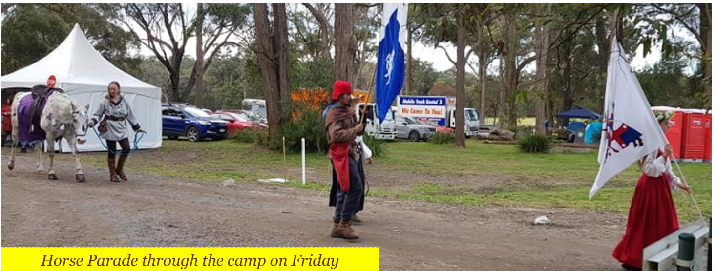
Horse Parade through the camp on Friday

And a longer parade would garner even more attention than our three did this time, especially from the kiddies who stopped playing at their castle to watch the horses parade by.