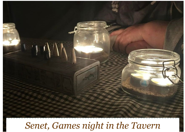
Senet, Games night in the Tavern