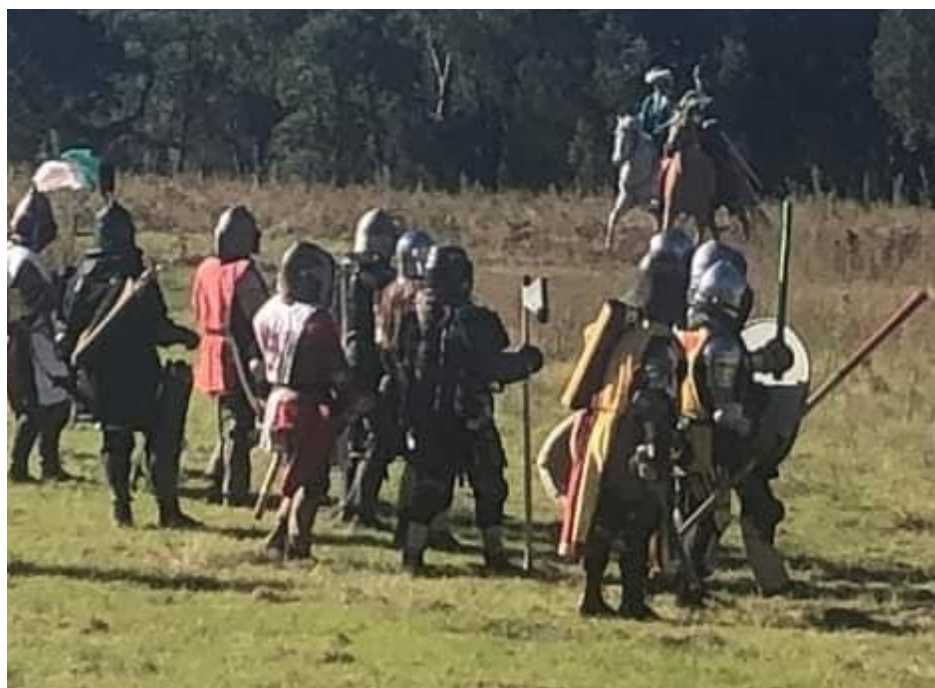
Equestrian charge to start the afternoon war scenarios, Festival LVI

Disclaimer: Bordescros Grapevine is the quarterly unofficial newsletter of the Shire of Bordescros within the Kingdom of Lochac in the Society for Creative Anachronism (Australia) Inc. It does not delineate SCA or SCA Ltd policies. ©2021, 2022 Society for Creative Anachronism Ltd - Albury Wodonga CONTACT: chronicler@bordescros.lochac.sca.org if you have anything you would like to add to any of our Broad sheets or Grapevine.