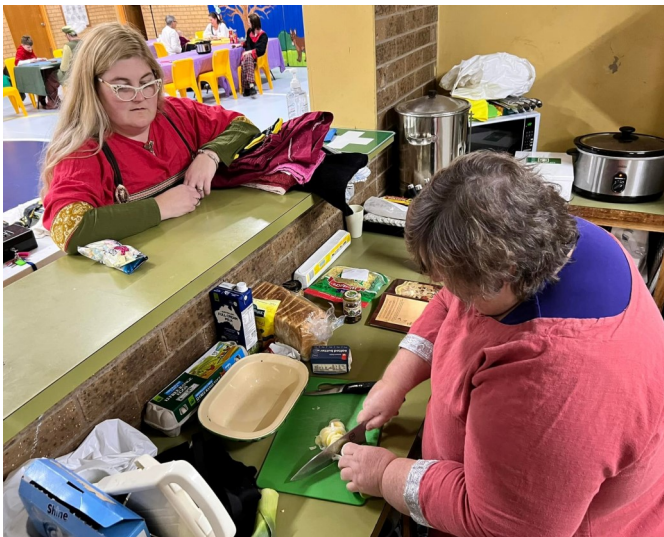
^^ Cooking Class at July Gathering